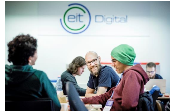
Coaching during an evaluation session