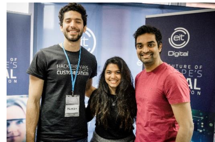
Master School Students at DeepHack Berlin 2018